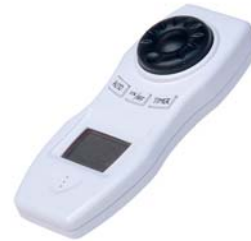
Hand control module with speed dial, timer and manual / auto mode buttons, and LED screen