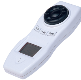
Hand control module with speed dial, timer and manual / auto mode buttons, and LED screen